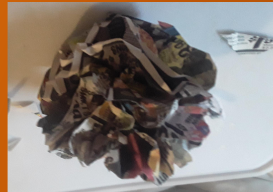
Gently separate the pieces and fluff it out