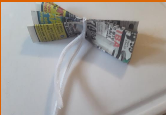
Wrap a pipe cleaner around the middle