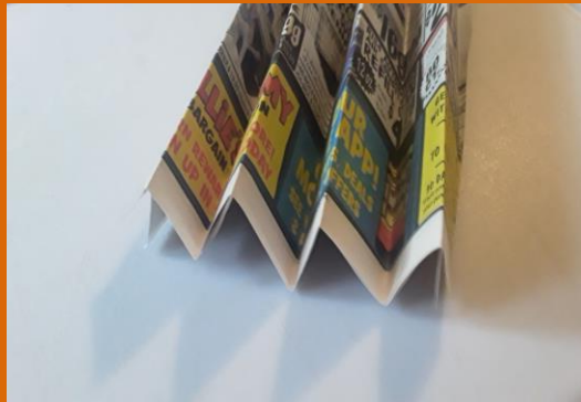
Fold paper back and forth