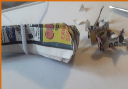
Round the edges