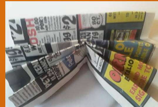
Fold the stack in half