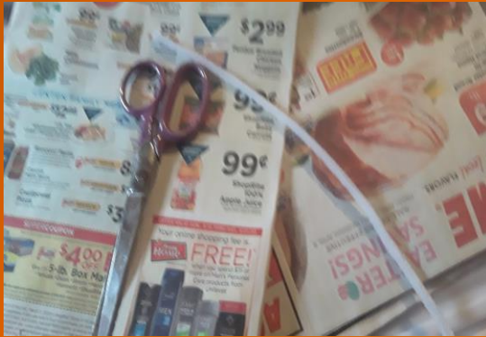
Newspapers scissors, pipe cleaner